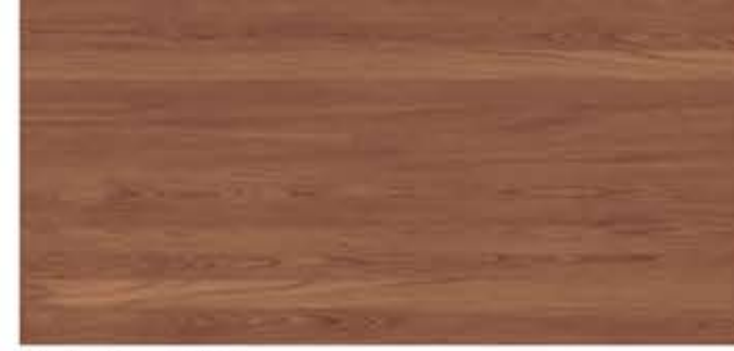
● W18 Grey Ironbark