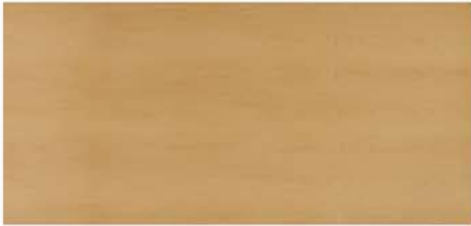
● W3 Oak