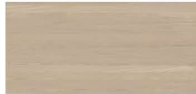
● W33 Nordic Oak