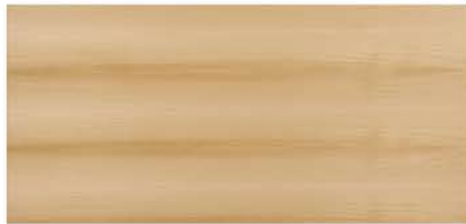
● W6 Eucalyptus