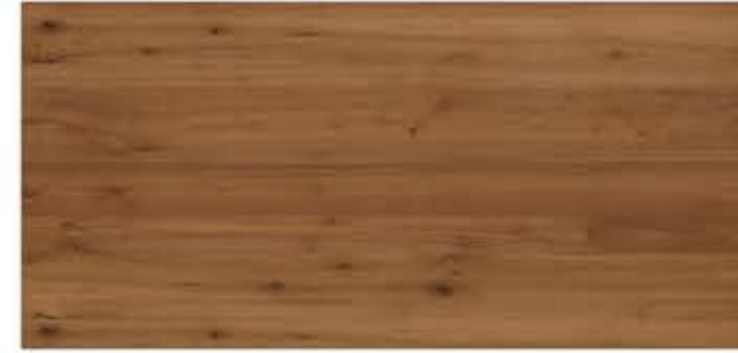
● W21 Black Walnut