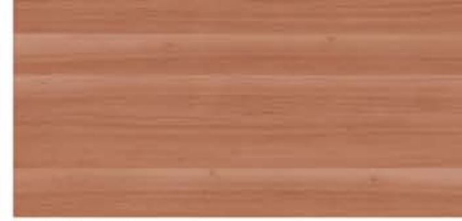
● W19 Blue Gum