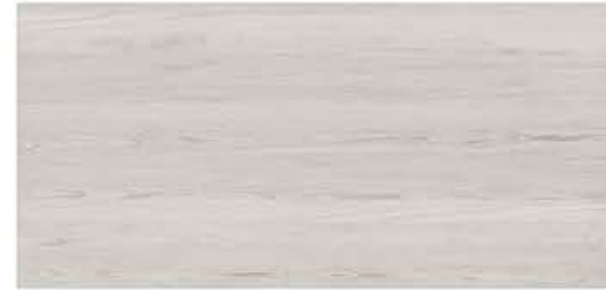
● W31 Whitewash Gum