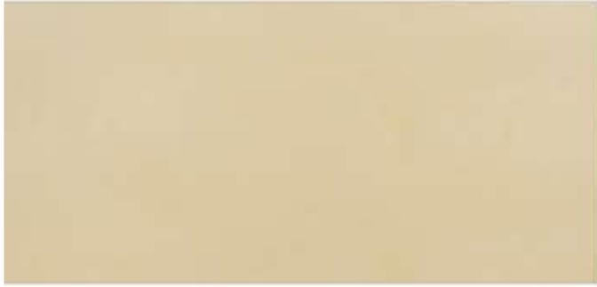
● W1 Birch