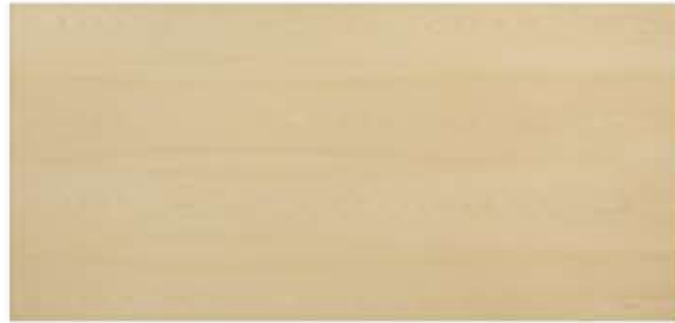
● W4 American Ash