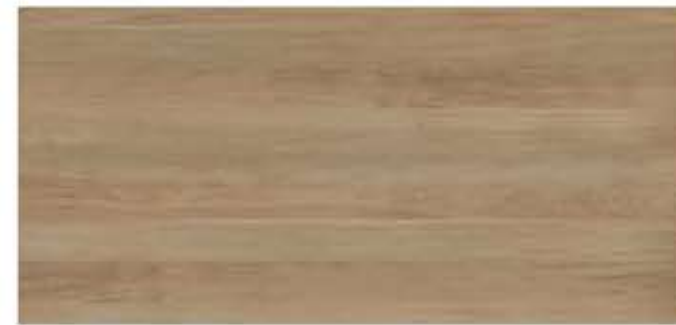
● W32 Aged Oak