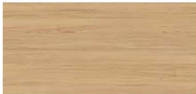
● W12 Tasmanian Oak