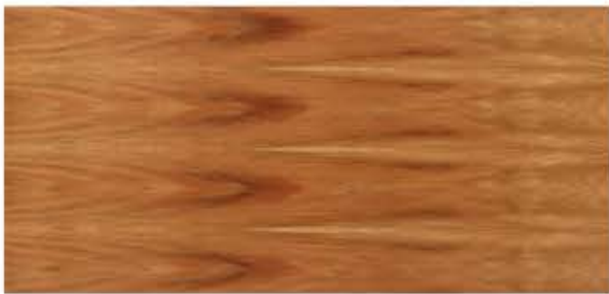
● W5 Tasmanian Blackwood