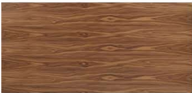
● W7 Queensland Walnut