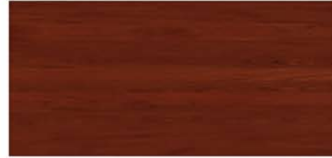
● W20 Jarrah