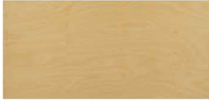
● W2 Hoop Pine