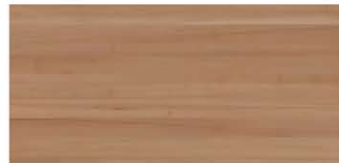
● W34 Blackbutt

We are always developing and adding to our range, please contact your Autex Acoustics representative to discuss Acoustic Timber options tailored for your project.